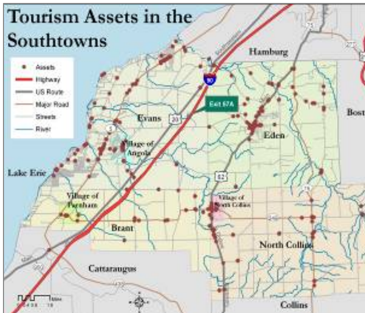
The Southtowns area includes the Towns of Evans, Eden, Brant and North Collins and the Villages of Angola, Farnham and North Collins.

– the Towns of Evans, Brant, North Collins and Eden, and their respective Villages of Angola, Farnham and North Collins. Included in the inventory are the area's historic sites, heritage resources, arts and cultural venues, recreational assets, natural resources, entertainment venues and hospitality services such as shopping, dining and lodging.