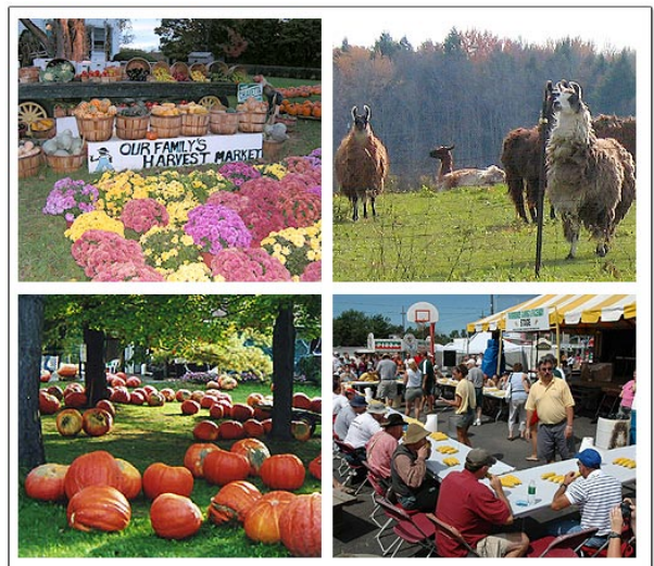
Selling fall flowers at Our Family's Harvest Market (Brant); llamas at Strawberry Hill Farm (Eden); giant pumpkins at Awald's (North Collins); corn eating contest Eden Corn Festival (Eden).

Although the agrarian economy is stronger in some Southtowns municipalities than in others, all four towns have something to contribute to the development of an agritourism industry. Ranging from vegetables to dairy, to greenhouses to alpacas, to horses to buffaloes, the Southtowns' 52 agricultural assets undoubtedly offer a wide range of things to see and do. In Eden, vegetable farming is predominant, and many farms are third-generation enterprises. The Eden Corn Festival draws over 100,000 people in August for a four-day event that includes the sale of 65,000 ears of corn, parades, rides, entertainment, and a beauty pageant. Eden is also home to Eden Valley Alpacas, where visitors can arrange tours or visit