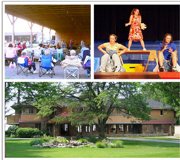
Brant Concert in the Park Series ; Lake Shore Community Players production in Evans ; Graycliff in Evans

Another challenge particular to the cultural industry is the question of whether the full extent of the Southtowns' cultural resources has been captured in the inventory. For instance, only a few artisans are catalogued in the inventory, though there are likely many others. Many artists and craftspeople do business by word of mouth and out of their private residence, which may explain why there is a general lack of awareness of these assets.