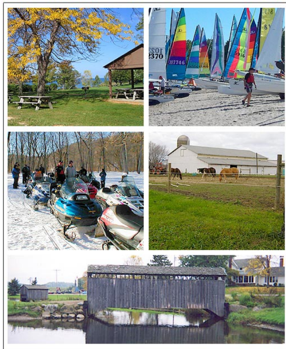
Evangola State Park (Brant); Hobie Kenobie Sailboat Regatta (Evans); Snowmobiling in Eden; Pine Tree Riding Stables (Brant); Edwin Winter's Outdoor Museum (North Collins).

With Lake Erie as the western border, hundreds of acres of forest, the fossil-rich and fish-stocked Eighteen Mile Creek, and multiple nature preserves, the Southtowns area is well endowed with natural assets. Indeed, although only 20 miles south of Buffalo, visitors can feel a world away when surrounded by the Southtowns' natural beauty and open space. One of the area's more