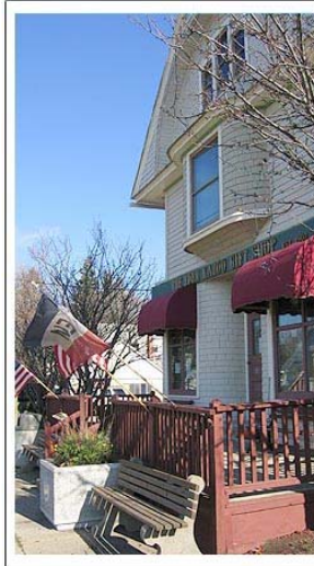
Kazoo Boutique (Eden); Fintak Loom Woven Rugs (North Collins); Ravensong (North Collins)

unique shopping experience. For instance, the area features several antique shops, a loom woven rug shop, a gift shop for America's last manufacturer of metal kazoos, a Native American art and gift store, and an Alpaca yarn and clothing store. These venues and activities would appeal to the typical cultural or heritage traveler. According to Partners in Tourism, today's travelers are well educated and well traveled and "...expect more from their travel experiences – making quality and authenticity more important than ever before." 12