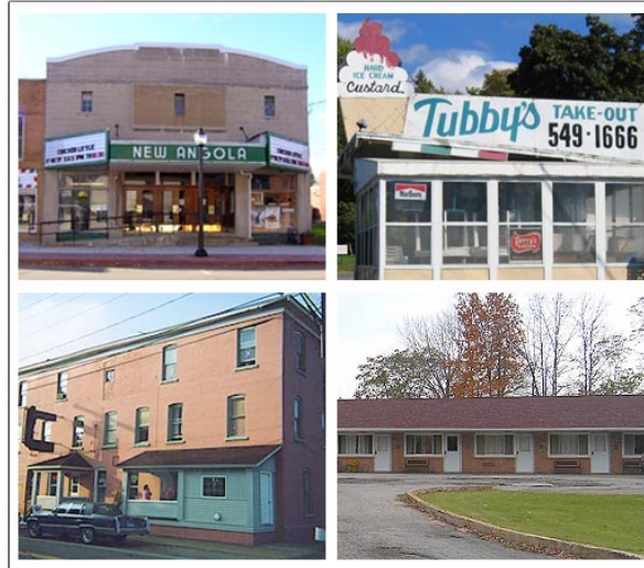
A complete visitor experience might include entertainment (New Angola Theatre/Angola), dining choices (Tubby's Take-out, near Lake Erie/Evans or North Collins Hotel/North Collins Village); and lodging (Angola Motel/Angola)

The total quality of the visitor experience is becoming more important to tourists and the development of a destination. In other words, activities such as purchasing tickets, and locating and traveling to the various tourism businesses need to be as hassle-free as possible. 22 The Southtowns area has many existing strengths in this area. Its town and village centers are pedestrian friendly (with recent investments made in aesthetically improving streetscapes). The Southtowns is also strategically located off the New York State Thruway and is accessible via major highways including Routes 5, 20, 62 and 75, which crisscross the broader region and connect with other major routes outside the area. Although public transportation in the area is weak, the Niagara Frontier Transportation Authority has announced plans to begin bus service along Route 62 to link Niagara and northern Erie Counties with Eden, North Collins and Gowanda to the south starting in September 2006.