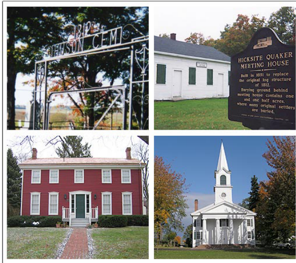
Historic assets include the Huson Cemetery (Brant); Hicksite Quaker Meeting House (North Collins); Asa Warren House (Eden); and the First Church of Evans (Evans).

The Southtowns' collection of historic assets is diverse and distinctly authentic, and would certainly appeal to visitors both within and beyond the region.